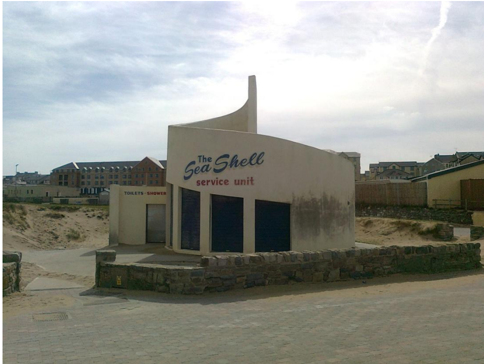
Plate 5. The Seashell Public Convenience Unit, Bundoran, before facelift.

The Seashell Unit Public Convenience (PC) in Bundoran has undergone a major facelift, sponsored by Dulux Paints, and carried out by the local Tús Scheme (see Plates 5 and 6 below). It is hoped that this upgrade may be an added attraction to the private sector to make more business use of this facility.