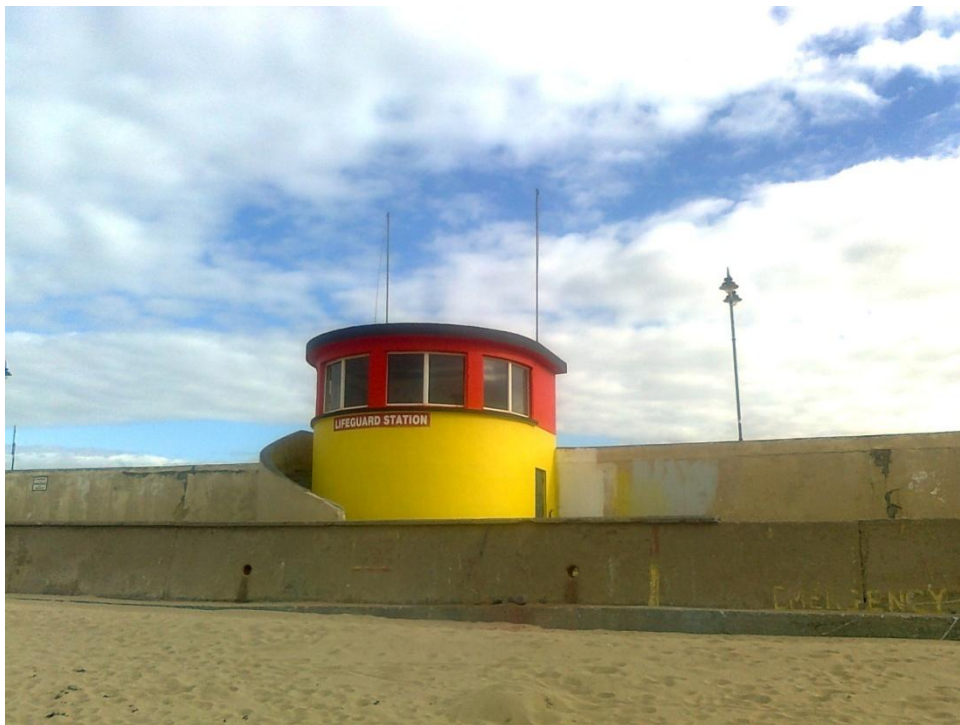
Plate 2. Bundoran Lifeguard Station following recent facelift.