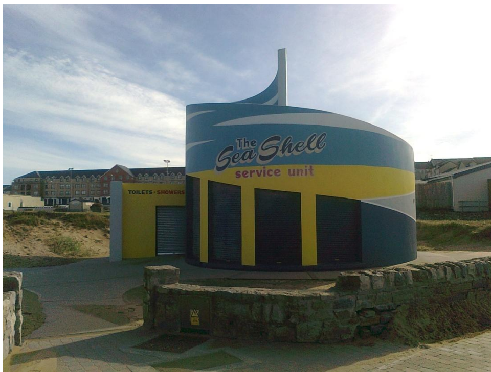
Plate 6. The Seashell Public Convenience Unit, Bundoran, following facelift.