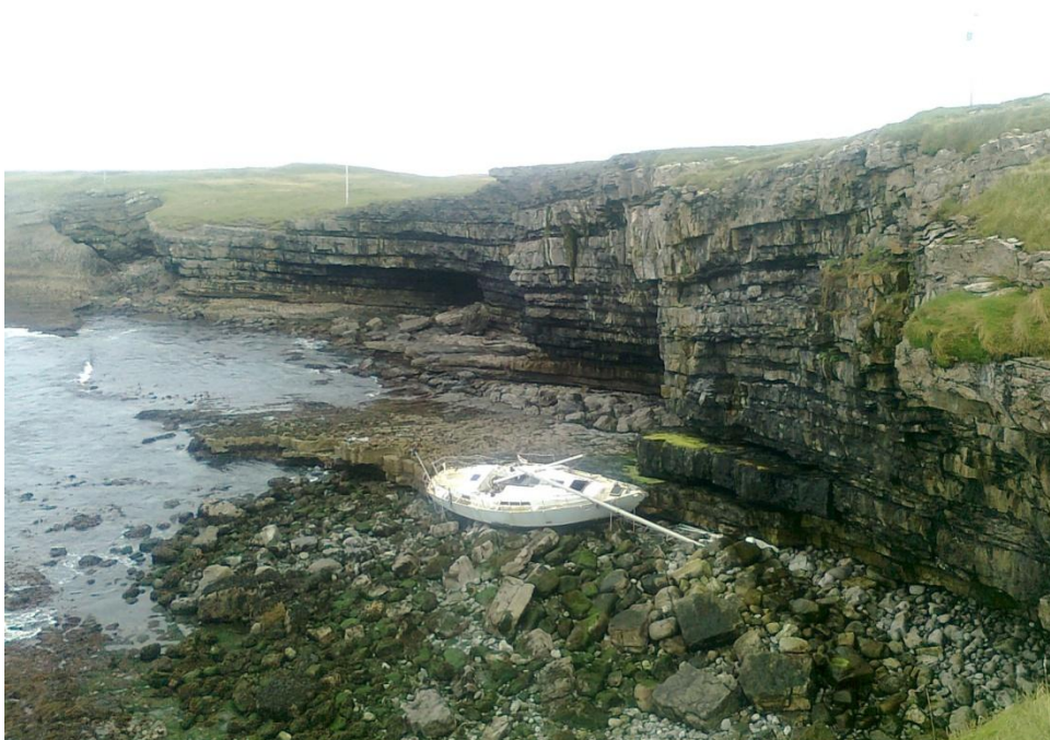
Plate 4. Shipwrecked yacht off St. Johns Point accessible by scavengers when the tide is out.