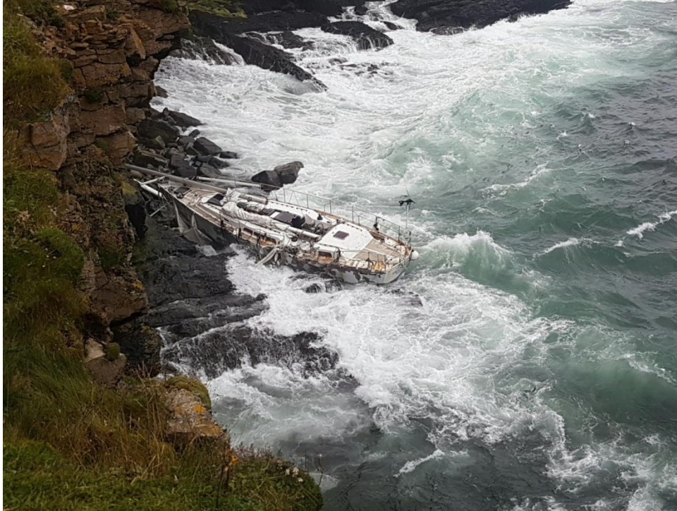
Plate 3. Shipwrecked yacht off St. Johns Point (tide in).

The Coastguard had a marine salvage team assess the vessel but unfortunately it is not feasible for them to salvage the vessel. Similarly, the Environment Section had two permitted salvage operators assess the wreck from the land. Their initial response is that it could prove problematic but they are considering options. However, their costs may prove prohibitive.