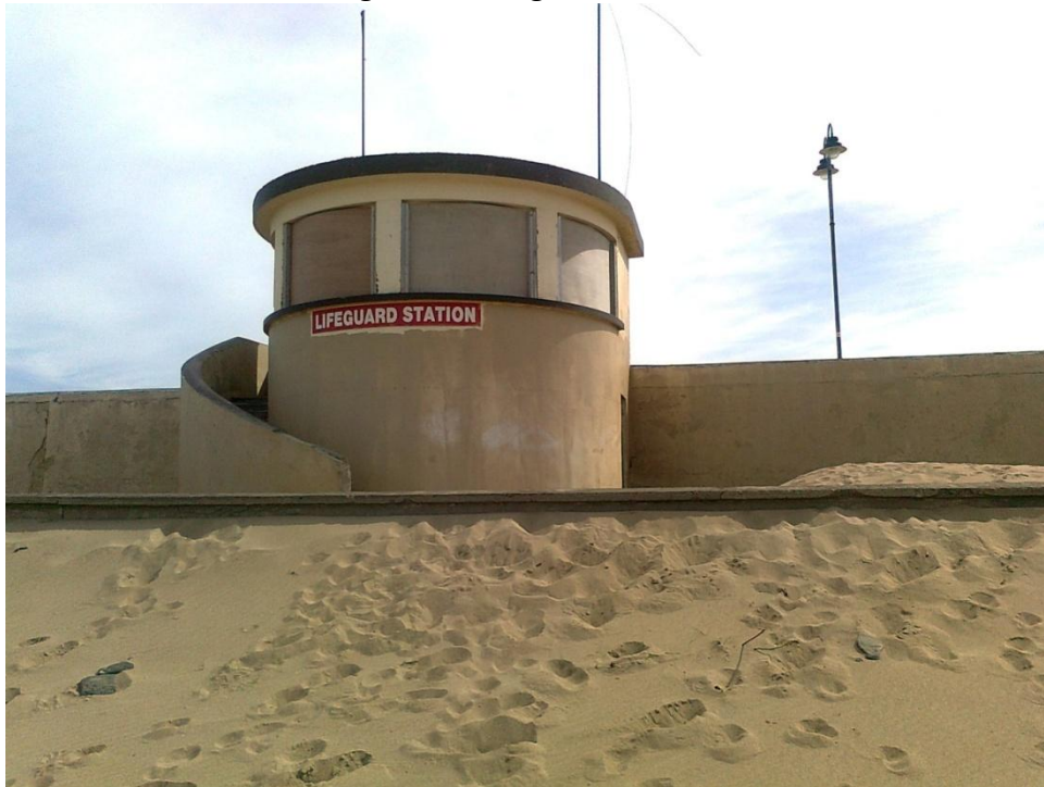
Plate 1. Bundoran Lifeguard Station before facelift.

The Bundoran Lifeguard Station has undergone a major facelift, sponsored by Dulux Paints, and carried out by the local Tús Scheme. The unit is now fully decorated in the distinctive red over yellow colours (see Plates 1 and 2 below). This makes the unit easily recognisable from the water/beach for access to the Lifeguards and associated services during the bathing season.